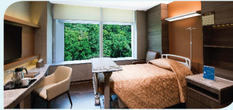
| Semi-Private Single 半私家單人房