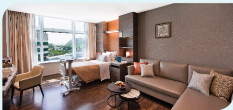
| Private Single 私家房