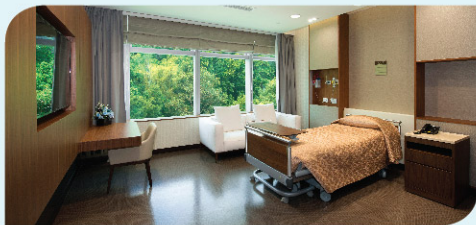
| VIP Suite - Imperial 貴賓套房 - 帝皇