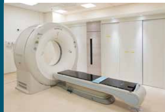
| CT Simulator