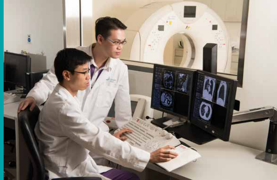
| Radiology Department