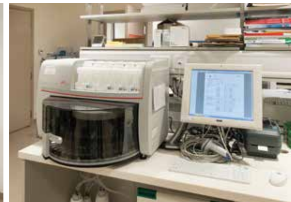
| Special Staining Equipment