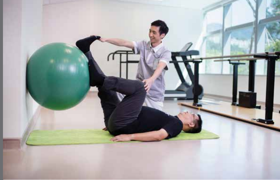
| Rehabilitation Centre