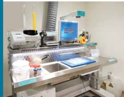
| Grossing Room and Frozen Section