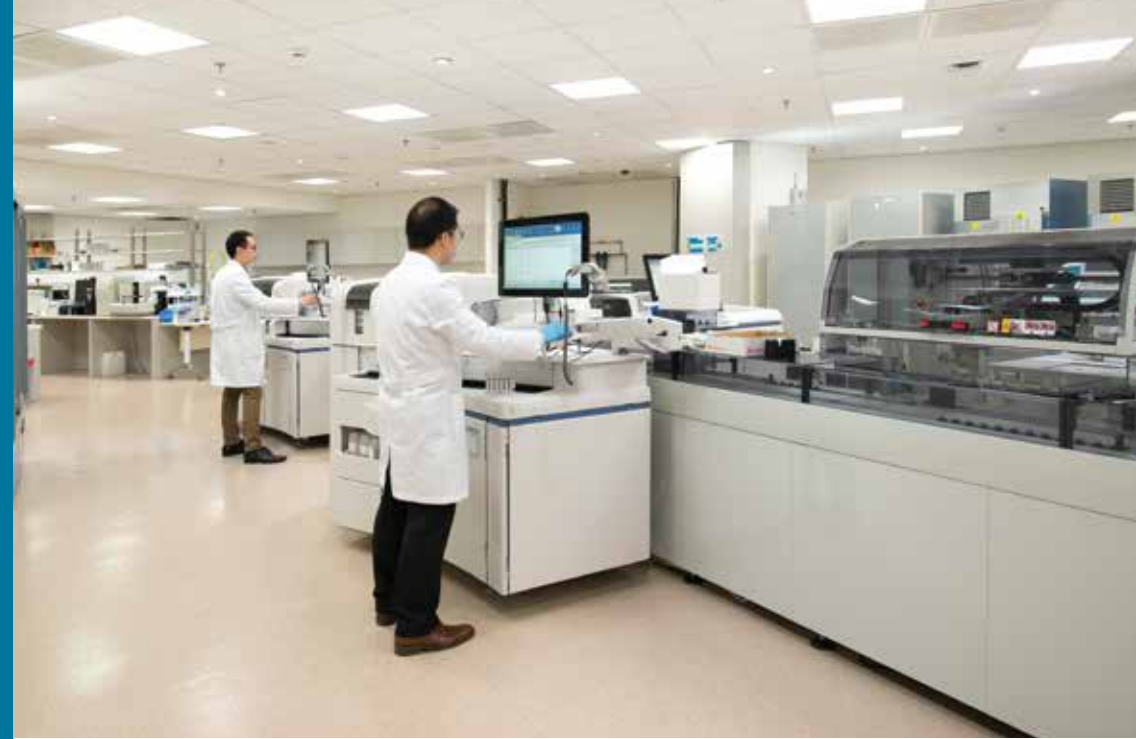
| Clinical Laboratory