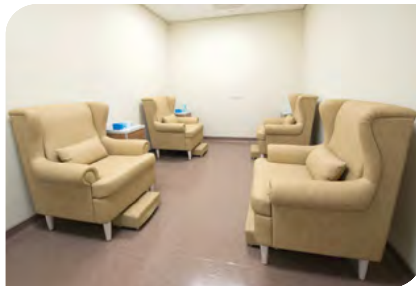
Breastfeeding Room 母乳育嬰室 (Mother can choose to feed the baby at the Breastfeeding Room 母親可選擇到母乳育嬰室餵哺)

所有嬰兒一般都是按需要餵哺，新生嬰兒會有不同的餵哺模式，但在24小時內至少應該有八次餵哺。最初，新生嬰兒只需要少量的初乳，隨著媽媽上奶而增加吃奶量。如果您可以聽到嬰兒有節奏地吞嚥吸吮及停頓而且嬰兒體重有增加和有足夠的大小便，那麼餵哺便是成功的。歡迎向哺乳顧問、助產士或育嬰室護士詢問有關寶寶吸吮、餵哺姿勢、餵哺模式和母乳餵哺支持網絡等資料。