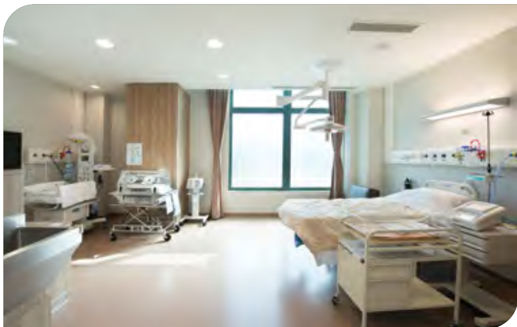
Labour &amp; Delivery room 產房