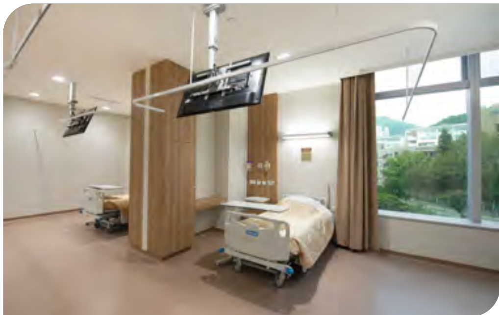
Antenatal Observation Room 產前觀察室