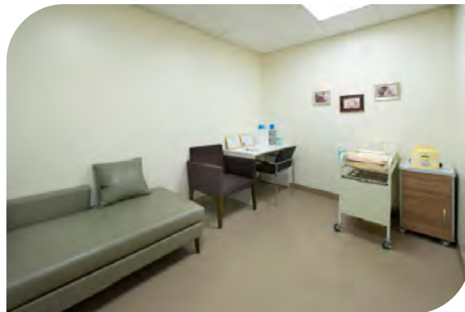
Lactation Clinic 母乳餵哺診所