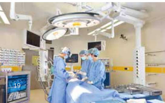
| Versius Surgical Robotic System