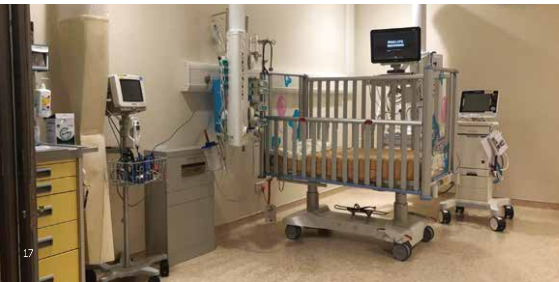
| Neonatal Intensive Care Unit